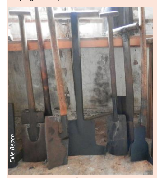
Peat digging tools from around the UK: same task - different designs

'It's to do with Christmas,' he says, trying to help us.