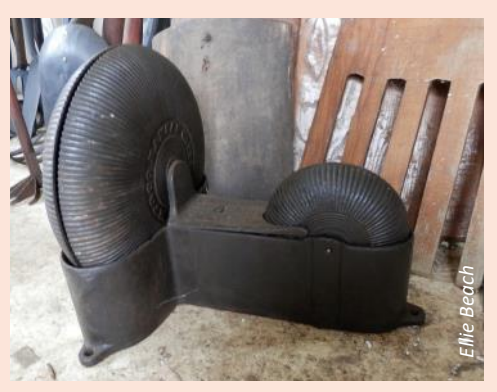
Brian's beautiful, antique hog oiler

'I've always had a passion for old tools,' he says. 'I started collecting them about 10 years ago. The Diss auction is very good: you'll find things there that you won't see at other sales.'