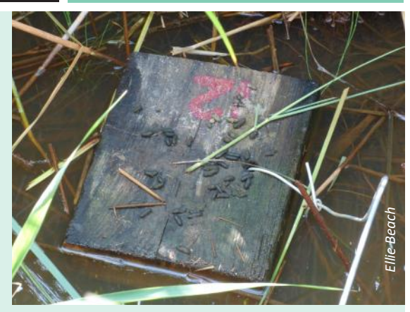
Water vole monitoring raft

With a crack team of volunteers, we installed 13 rafts on two sites - Scarfe Meadows near Garboldisham and The Lows near Redgrave and Lopham Fen. After a week the rafts were checked - on Scarfe Meadows, four out of seven rafts had droppings and some feeding remains; on The Lows all six rafts had