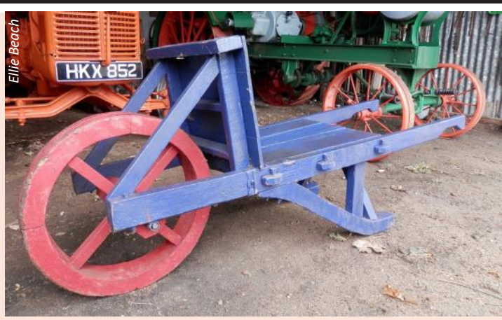
An Irish peat barrow

'I'm not interested in what they are worth,' he says, 'I just like talking to people who are interested in them.