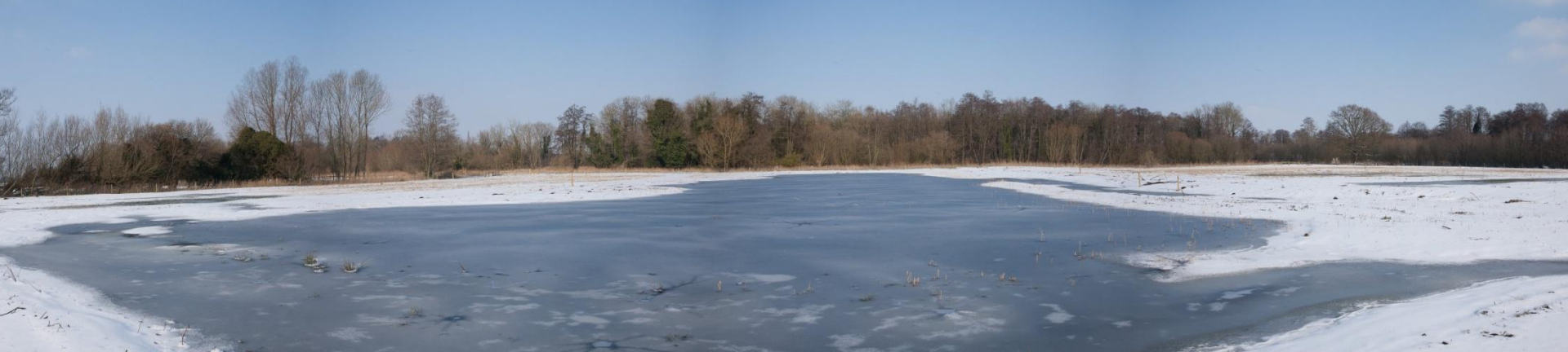
Webbs Fen through the seasons