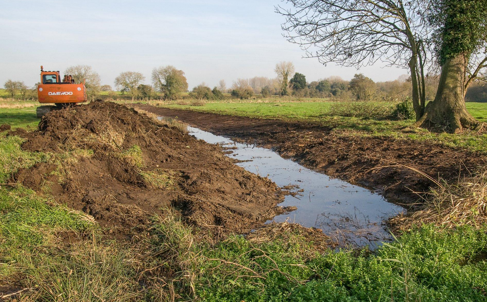
A ditch was cleaned out in Scarfe Meadows to make it better for water voles and water plants